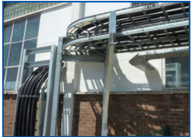
Glazing replacement panels with multiple cable entries