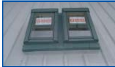
Pitched velux windows