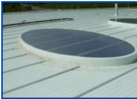
6m x 3m elliptical curb & weathering