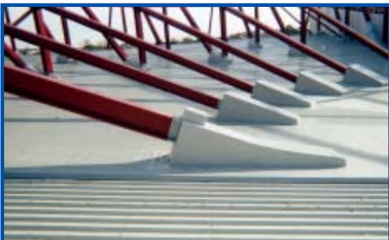
Multiple details to membrane roof