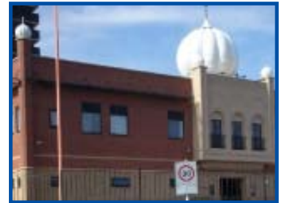
Domes & textured facade

GRP lends itself well to the forming of complex shapes and curves often unachievable in PPC steel or aluminium. We can offer technical advice to ensure an aesthetically pleasing and economical solution. A huge range of colours and finishes are available.