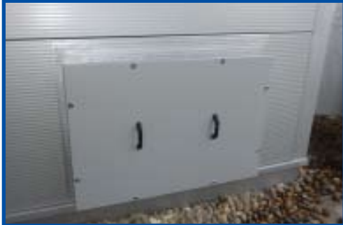
Bespoke access panels

Jones & Woolman (UK) Ltd can supply and fit a wide range of roof units or we can make & fit load bearing curbs to suit customers units.