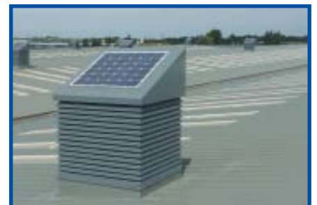
SVP fitted & weathering completed by J&W