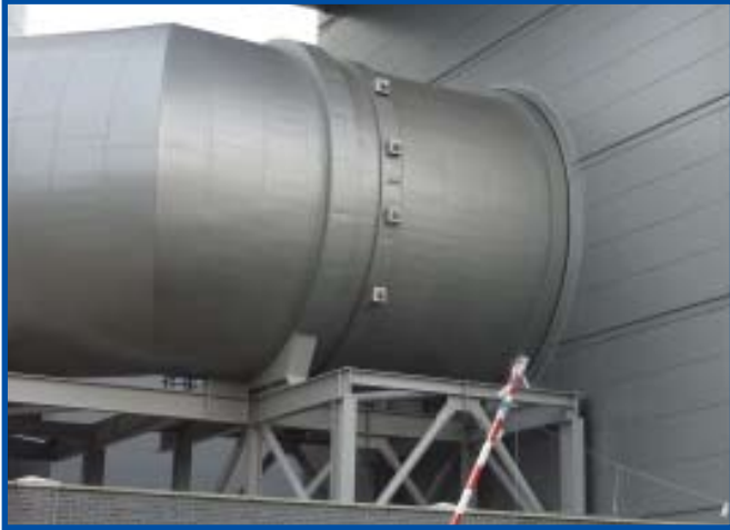
9m diameter movement detail flue to vertical cladding

We have developed systems for individual and multiple penetrations through most types of cladding systems.