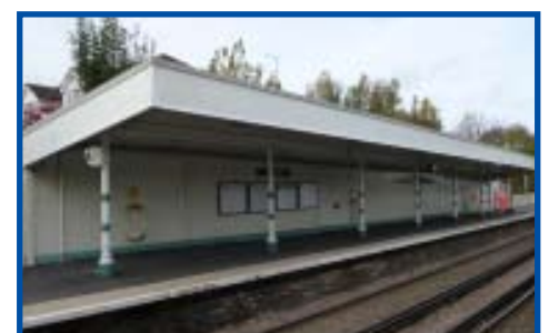
GRP panels to canopy

This page shows a small selection of contracts completed by Jones & Woolman (UK) Ltd.