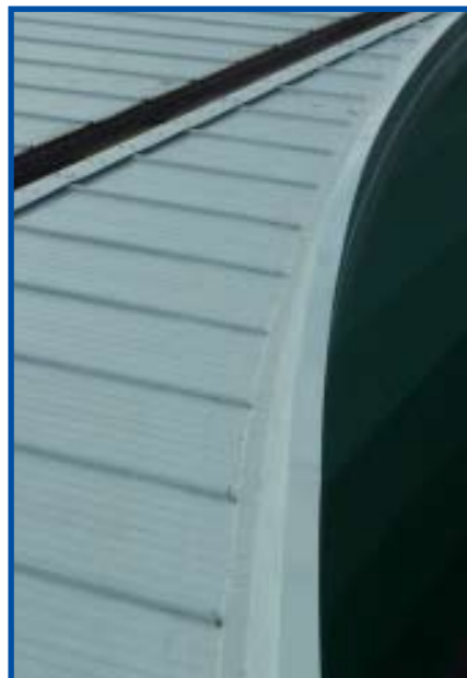
Curved weathering detail & fascia