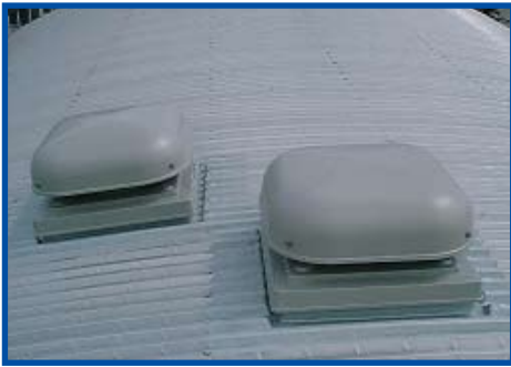
Curbs to curved roof